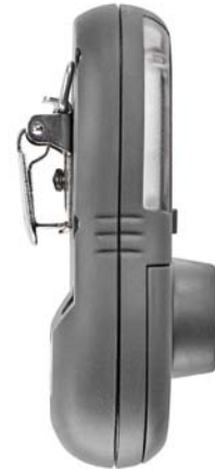
Available in Red or Grey