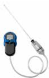
PICTURED WITH OPTIONAL SLIP-ON PUMP AND 12-INCH PROBE